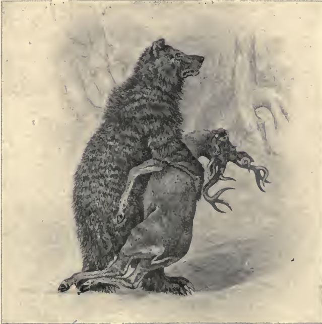
FIG. XLIX. URSUS H. HORRIÆUS . MEXICAN GRIZZLY BEAR.